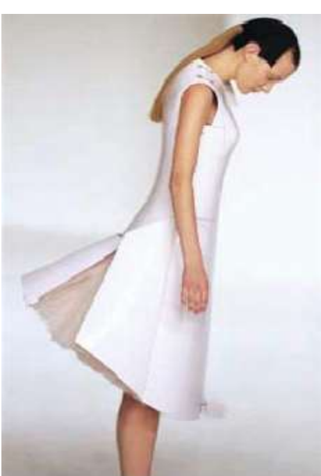
Before Minus Now, Spring/Summer (2000), London, UK, Keywords: remote control, fiberglass