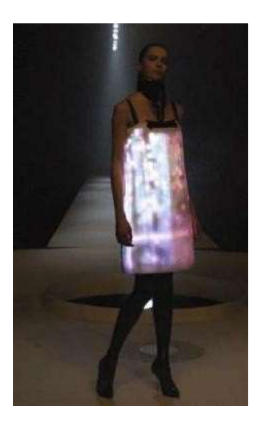
Airborne, Autumn/Winter (2007), London, UKWith Swarowski(Keywords: display, LEDs, film)

Hussein pushes the boundaries of fashion by integrating the latest LED technology into his fashion collection. The collection uses climate as a metaphor and reflects our primal feelings towards nature and the cycles of weather. An LED dress consisting of 15,600 LEDs, combined with crystal, displays short abstract films that correspond to the arrival of a particular season.