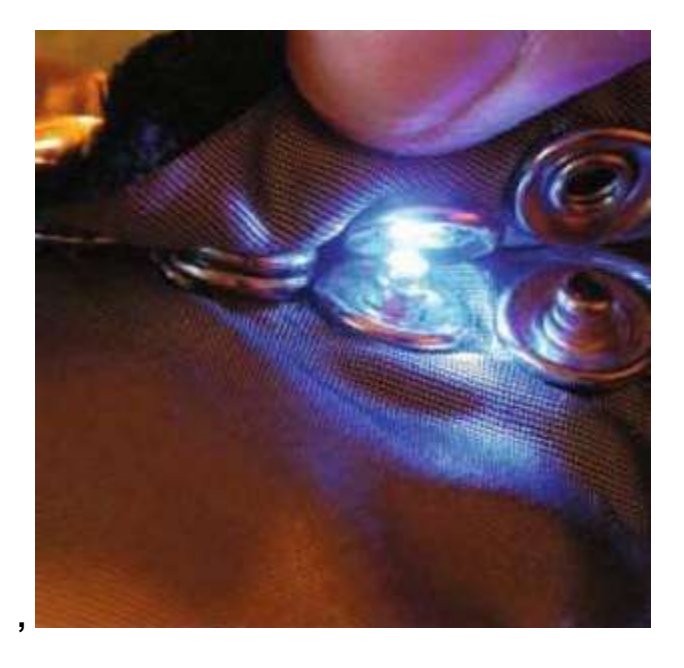
Blazer (2003), Montreal, Canada By Joanna Berzowska

Constellation Dresses (2004), Montreal, Canada, By Joanna Berzowska Keywords: electronic garments, smart clothes, conductive textile, power distribution The Constellation Dresses are covered with twelve magnetic snaps arranged over the torso and thighs and connected in pairs using a single line of conductive thread. LEDs are integrated into the dresses in a design that resembles a constellation. Sets of snaps act as switches that, when connected to the snaps of another dress, complete circuits that light up the LEDs. The magnetic snaps act as a mechanical and electrical connection between bodies. Their irregular placement induces wearers to create playful and compelling choreographies to connect their circuits.