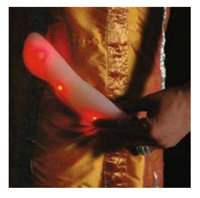
Leeches (2004), Montreal, CanadaBy Joanna Berzowska

Electronic garments, smart clothes, conductive textile, power distribution The Leeches dress, constructed with stitched conductive organza stripes, functions as a soft, wearable, and reconfigurable power-distribution substrate for attaching individual silicone-coated electronic modules (the 'Leeches') that illuminate the dress. The Leeches can be attached in a varietyof positions and configurations. They are heldin place by magnetic snaps, which act both as mechanical and electrical connections. A single powermodule can be attached at the shoulder and can power up to ten Leeches. The red LEDs inside the Leeches suggest power-hungry creatures that, once attached, suck or draw power (the metaphoric 'blood') from your body. The Leeches dress provides comment on the potential dangers of electromagnetic fields emanating from electronic garments.