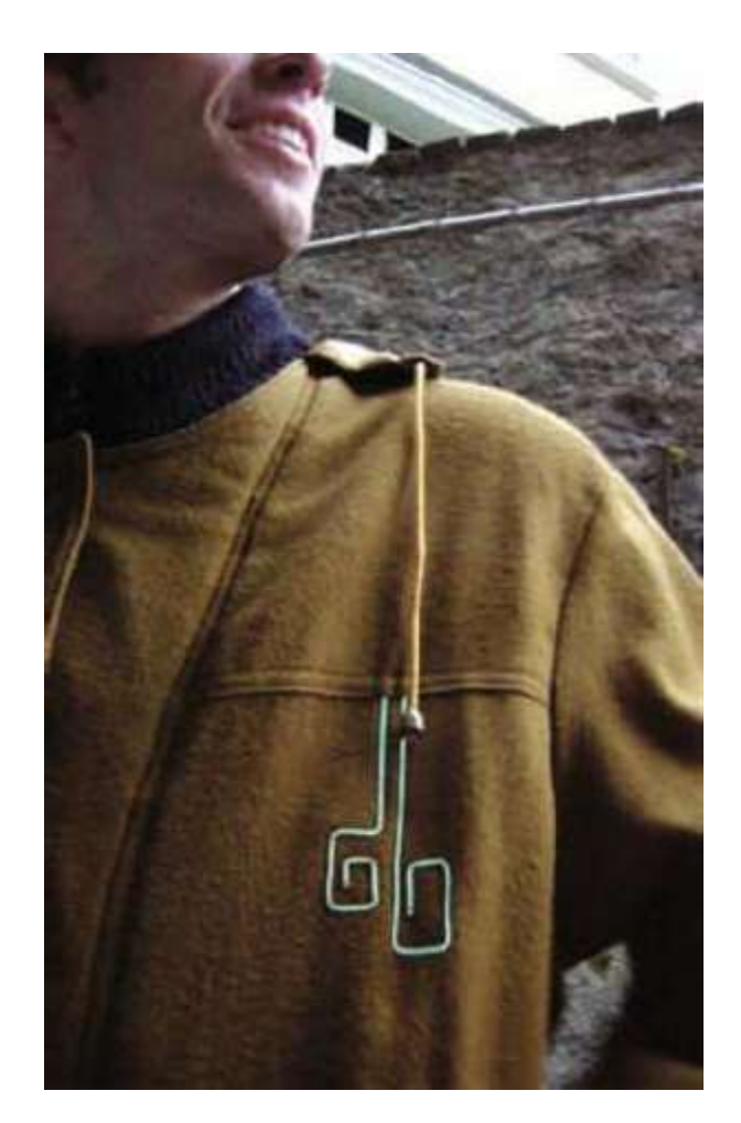
Compass Coat (2003) Interaction Institute Ivrea, Italy With Els Ossevoort

seedlings being blown away. Only the flowers that face the wind become active. The windier it gets the more responsive the dress becomes. Materials: silk, cotton, SMD LED's, microchips