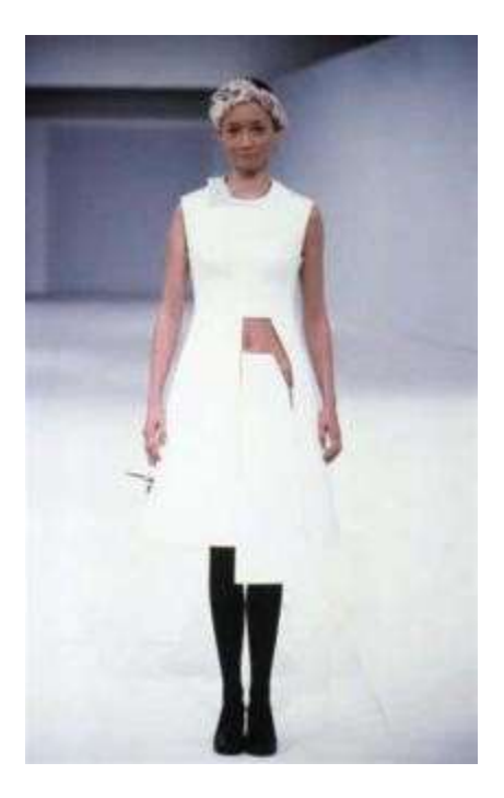
Echoform, Autumn/Winter (1999) London, UK Keywords: airplane, electronics, fiberglass

The collection focuses on the relationship between humans, nature and technology. A number of the dresses have irregular geometric shapes with stiffly protruding panels. The Remote Control Dress is operated with a remote control that opens the fiberglass panels of the dress to reveal the tulle inside. The main theme of the collection was speed and its associated technologies. The Airplane Dress is a fiberglass construction with a flap that can be operated electronically and moves like an airplane wing.