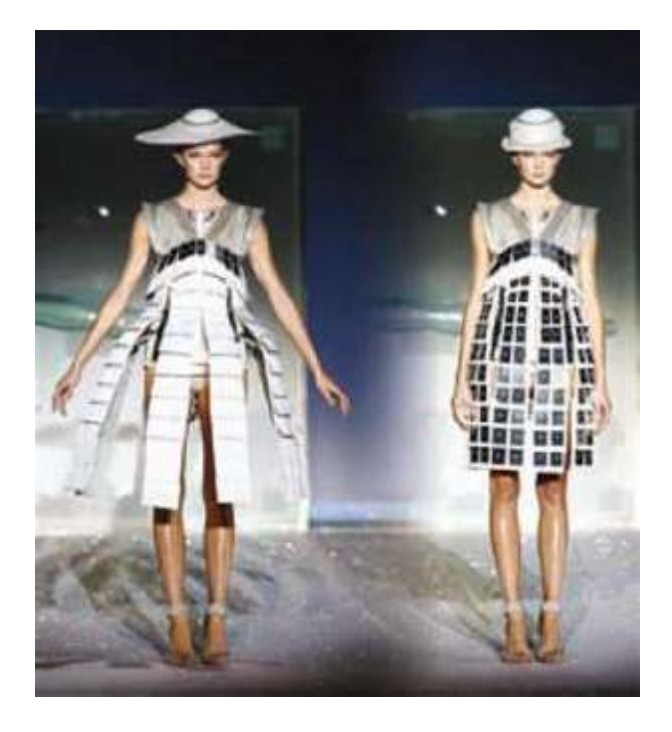
One Hundred and Eleven, Spring/Summer (2007), London, UK With Swarowski,