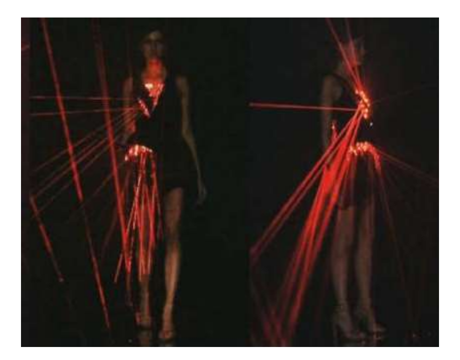
Readings, Spring/Summer (2008) London, UK

Readings is the title of the Spring/Summer collection and is also a film collaboration with leading crystal innovator Swarovski and Nick Knight's fashion broadcasting company SHOWstudio. The highlight of the collection is inspired by ancient sun worshipping and contemporary celebrity status. Laser lights are beamed through Swarovski crystals, reflecting light from the garment and bouncing it off mirrors surrounding it, thus representing theinterplay between the scrutinized figure and the audience.